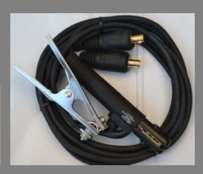
NOT INCLUDED IN BASIC PACKAGE: Additional charges apply.